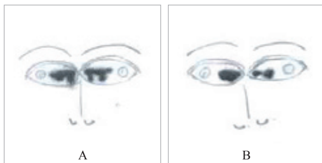
Figure 2. A. Patient with breast cancer during D treatment. B. One month after D treatment.

D treatment. Both dacryoscintigraphies, showed a bilateral total blockage of the drainage apparatus in the area of the lower canaliculus (Fig. 3A and B). Despite his complaints and discomfort, this patient was also reluctant to undergo any other procedures.