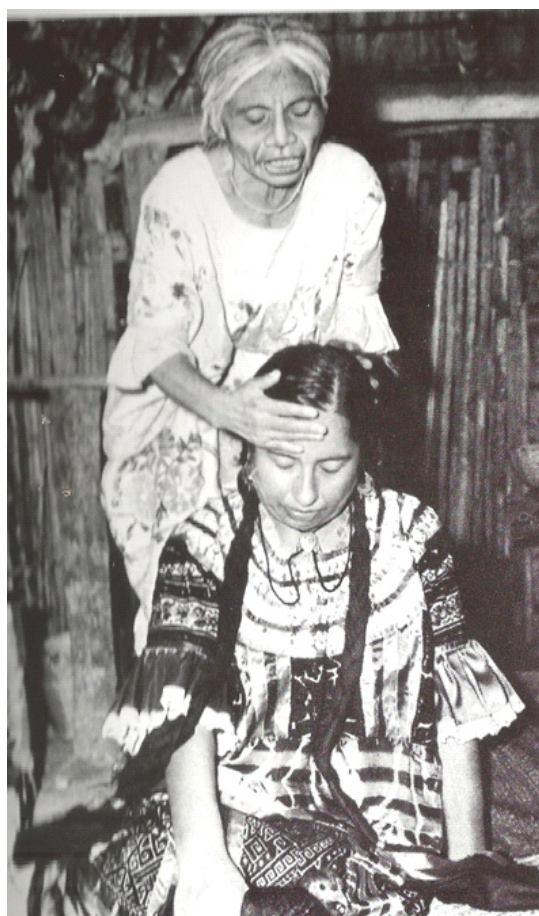
Mexican female which doctor "smokes" patient and invokes powers of pagan and Christian divinities. She then sucks out evil from patient's head and cleanses body by passing egg or black hen over it. Museo Nacional de Anthropologia, Mexico