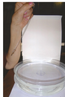
Figures 1,2. The metallic chain remains at first steady over the water and then moves in a cyclic manner, progressively faster.

After trying to keep the above conditions steady, we observed the following: