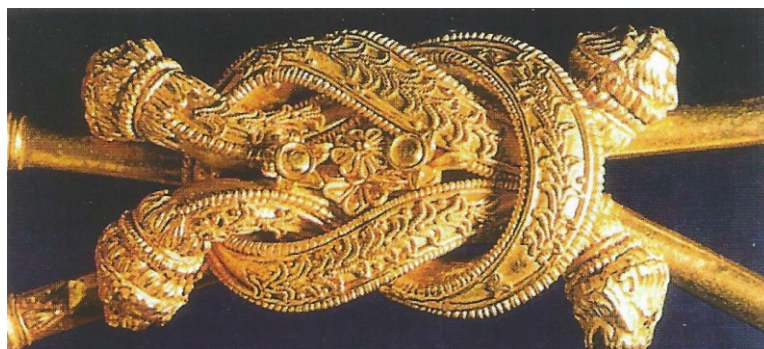
A golden knot-Hercules knot. In the Archaeological Museum of Thessaloniki. Hercules according to Isiodos, 7 th century b.C, was considered the father of Macedonians.