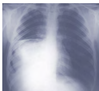
Figure 2. A Chest radiograph was requested for better assessment of the underlying cause