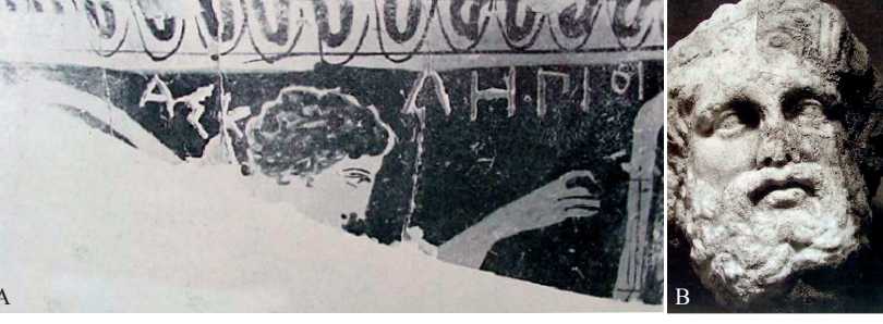
Figure 2. A. Inscribed potsherds from Antisara with the name of AΣΚΛΗΠΙΟΣ, found in modern Kalamitsa, Kavala, in 1980 [13]. B. Head of Asclepius from Dion [14]