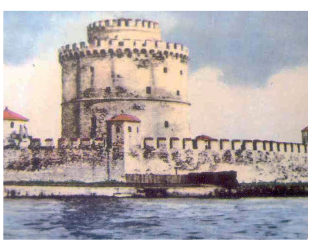
The White Tower of Thessaloniki in the 18th century was on a small island and fortified by strong walls.