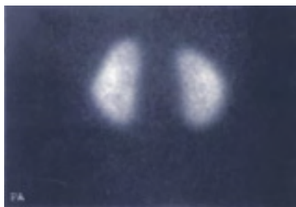
Figure 1. A normal DMSA study