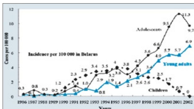
Figure 1. Increase in the number of thyroid carcinoma after 1986, starting in 1990, in subjects who were below 15 years of age at the time of diagnosis and were living in southern Belarus, and northern Ukraine, and after 1994 in children living in southern Russia.

To date more than 1.500 cases of thyroid cancer have been recorded that concern approximately 2 million children younger than 15 years who were exposed to the radioactive