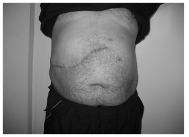
Figure 6. Postoperative findings.

Late deep incisional mesh infections usually manifest as chronic infections with skin pus fistulas in the area of hernioplasty without larger fluid collections around the mesh. Ultrasound and CT examinations show fistulous canals extending from skin to the infected mesh. However, US and CT are not helpful in determining diagnosis in all cases of "silent" mesh infection. One good solution for "silent" infection diagnosis is scintigraphy with <sup>99m</sup>Tc-Agc Ab [6]. There are very few cases reported about this infection following abdominal wall hernia surgery. Certain authors claim that scintigraphy can be used not only to evaluate vascular and orthopedic prostheses, as commonly is, but also to help evaluate prosthetic mesh after incisional hernia repair [12]. This technique should be employed as a complementary technique to CT in differentiating between postoperative inflammation and infection [13]. Late deep incisional mesh infections requiring a complex approach are best treated in specialised hernia centers. The treatment consists of infected mesh excision (most frequently complete) and management of the contaminated abdominal wall defect. There is no optimal solution for this type of abdominal wall defect. Nonresorbable mesh, which is a "gold standard" for major incisional hernia repair, must not be used in case