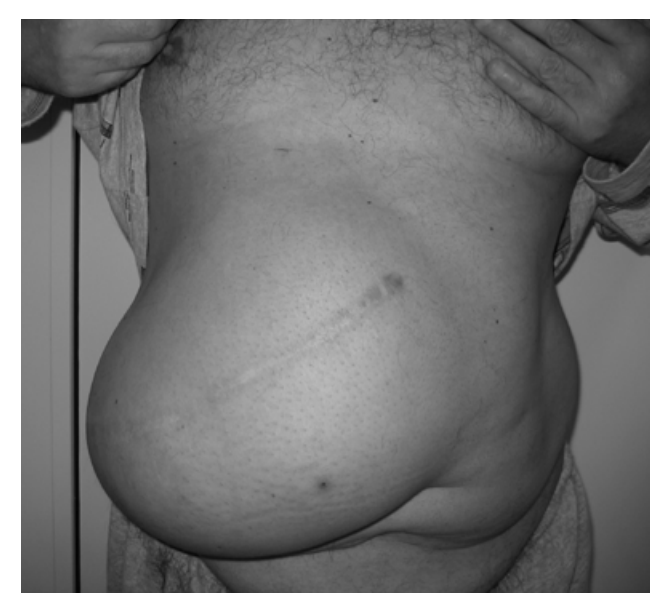
Figure 1. The patient with recurrent right subcostal incisional hernia.

Our patient was a 65 years male with right reccurent subcostal incisional hernia without clinical signs of infection as a result of several previous operations, which had as complications wound infection, right subcostal hernia, mesh infection and recurrent incisional hernia (Fig. 1). The <sup>99m</sup>Tc-Agc Ab scintigraphy showed a deep mesh infection of the the abdominal wall, in the region of the scar of previous operations; while US and CT indicated no infection (Fig. 2 and 3). Target-background ratio in the anterior scintigram was 3.2. Mesh repair, although followed by good early and late results in comparison to hernia recurrence, always bears the risk of a foreign body infection. Nonresorbable mesh should by no means be used in the presence of abdominal wall defect infection. Components separation technique could be used in contaminated wound conditions providing excellent early results, but with uncertain outcome regarding recurrence.