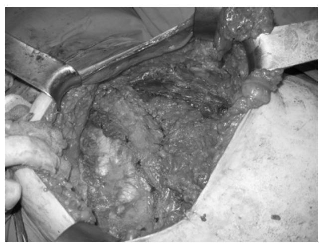
Figure 5. The patient with recurrent right subcostal incisional hernia. Recurrent hernia solved with Levine and Karp's (2001) method of "wide myofascial release" on the right side, Ennis's (2003) "open book" modified components separation technique and the dissection of the external oblique from the internal oblique muscle on the left side.

The right subcostal recurrent incisional hernia with «silent» deep mesh infection was faced with total mesh excision of the infected polypropylene and combination of various modified components separation techniques: Levine and Karp's (2001) method of "wide myofascial release" [10], the Ennis (2003) method of "open book" modified (CST-Component Separation Technique) [11] and the dissection of the external oblique from the internal oblique muscle (Fig. 4-6). Mesh was infected with staphylococcus epidermidis. Mesh infections can manifest as deep incisional or organ/space infections occurring as early as a few days to several months or delayed, between 3 months to 2 years after surgery or late infections occuring after more than 2 years [3]. The clinical presentation is of crucial significance for determining mesh infection, and techniques such as US and CT are helpful only to confirm the diagnosis.