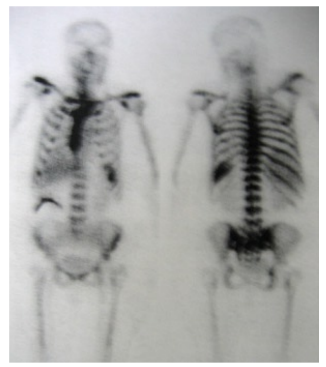
Figure 3. The patient with right subcostal incisional hernia. Radionuclide imaging 4h after application of the radiopharmaceutical, whole body anterior and posterior views: accumulation under the right costal margin, pointing at the infection.