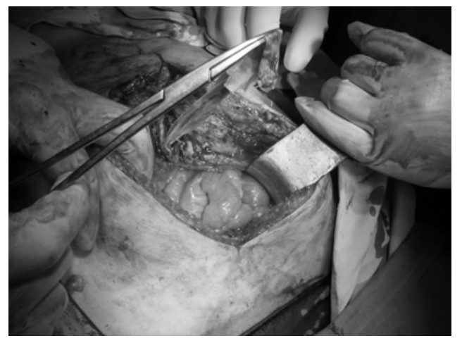
Figure 4. The patient with recurrent right ostal incisional hernia. Recurrent abdominal wall hernial defect and infected polypropylene mesh excision.

The right subcostal recurrent incisional hernia with «silent» deep mesh infection was faced with total mesh excision of the infected polypropylene and combination of various modified components separation techniques: Levine and Karp's (2001) method of "wide myofascial release" [10], the Ennis (2003) method of "open book" modified (CST-Component Separation Technique) [11] and the dissection of the external oblique from the internal oblique muscle (Fig. 4-6). Mesh was infected with staphylococcus epidermidis. Mesh infections can manifest as deep incisional or organ/space infections occurring as early as a few days to several months or delayed, between 3 months to 2 years after surgery or late infections occuring after more than 2 years [3]. The clinical presentation is of crucial significance for determining mesh infection, and techniques such as US and CT are helpful only to confirm the diagnosis.