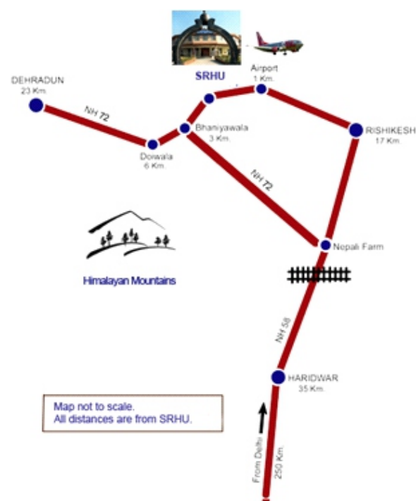
Figure 3. Our Institute (496m above sea level) in relation to Himalayan mountains and nearby