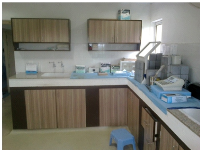
Figure 1. The hot Laboratory