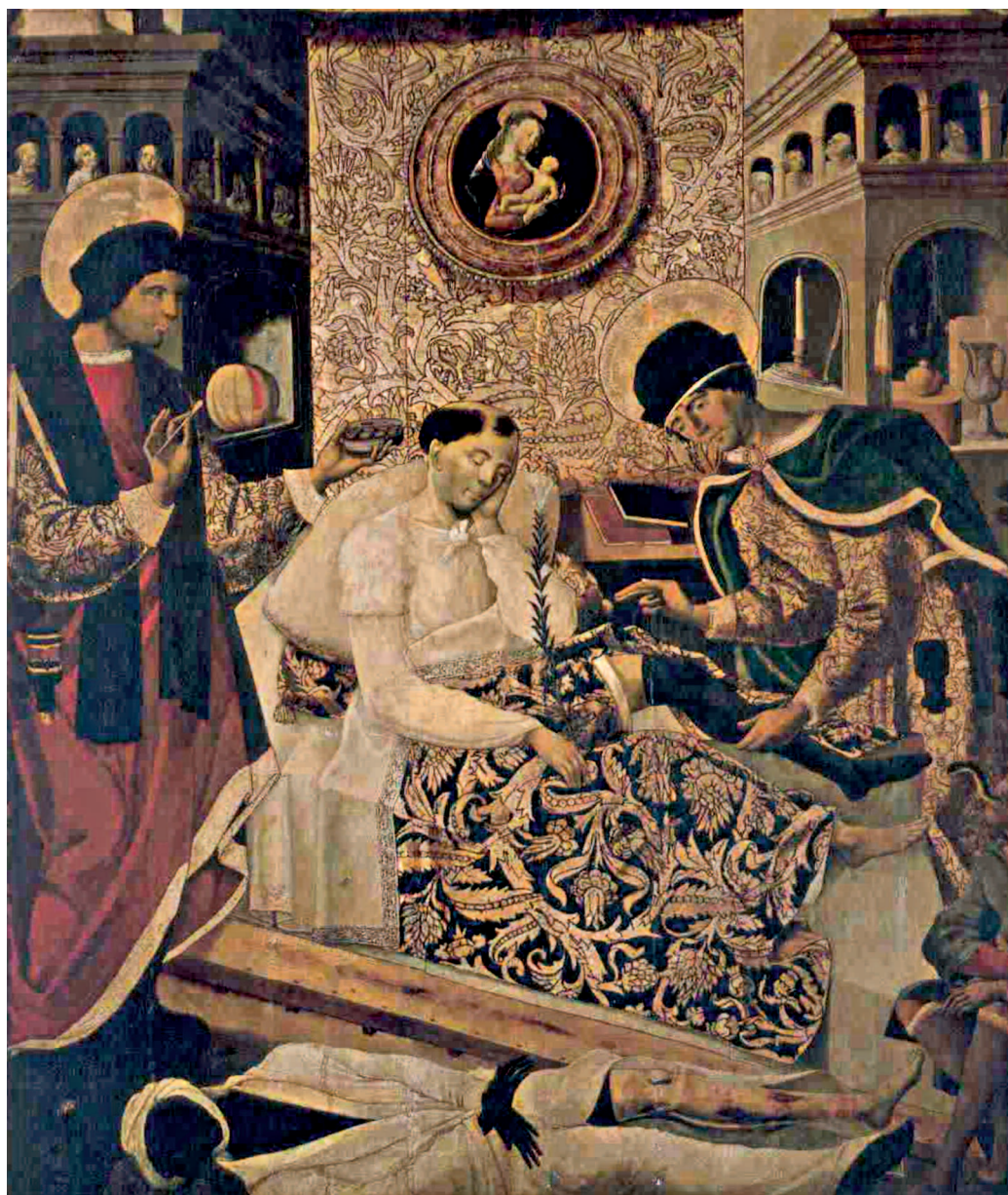
Fernando del Rincon-Madrid (15th century). Saints Cosmas and Damianos (Greeks from Asia Minor) have amputated the gangrenomatous leg of a patient and transplanted to him the leg of a dead Mauritian (seen at the lower part of the painting). One of the Saints is preparing a medicine for the transplanted leg. The patient is anesthetized and holds a twig of mandragora (sleeping drug). At the right lower part of the painting another "miracle" is described: the Saints have withdrawn a snake that a man had swallowed.