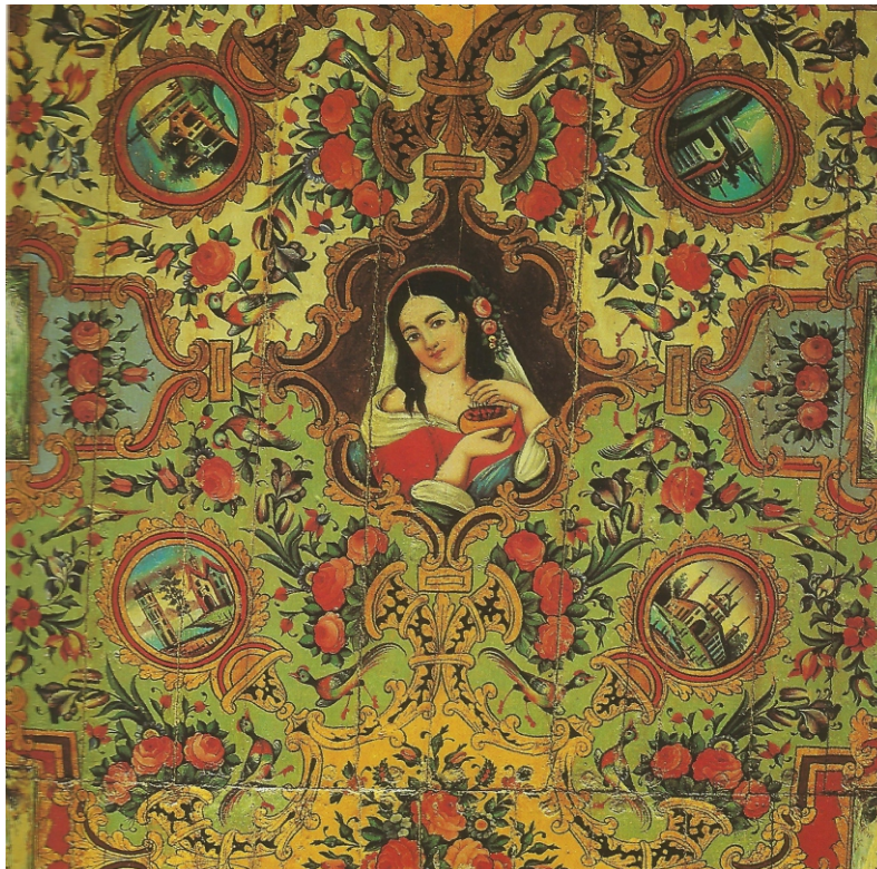
Interior design of Qavam House or Naranjestan, a 19th century residence which is called: Place of Oranges, Iran.