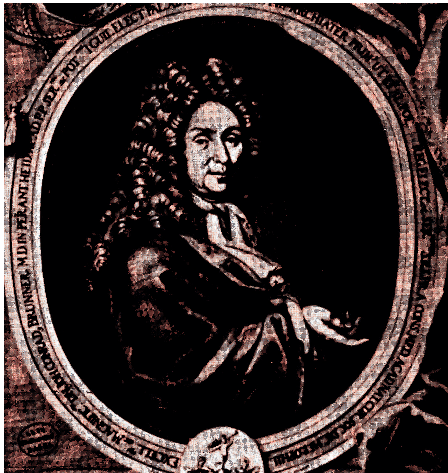
Dr Johann Conrad Brunner (1653-1727). He attempted ablating a dog's pancreas to induce diabetes. The ablation was incomplete and he falsely concluded that pancreas was unrelated to diabetes. This was then believed for the next 150 years.