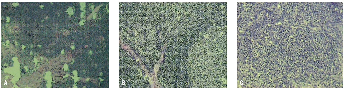
Figure 3. A: Histology H-E \times 100 , B: H-E \times 200 and C: Immunohistology \times 400 negative for melanoma infiltration.

sigmoid polyp was adenomatous, without any dysplasia. Extensive clinical examination, laboratory and radiological tests with whole body computerized tomography (CT) scan and transanal ultrasound (U/S) scan, one week after polypectomy, showed no metastases. Subsequently the patient underwent rigid proctoscopy and the anal scar resulting from previous polypectomy, received four submucosal injections of ^{99m}\text{Tc} -sulfur-nanocolloid ( ^{99m}\text{Tc} -SNC) of 29.6 MBq each, in order to determine SLNs. Planar lymphoscintigraphy was performed after the injection, in order to visualise the lymphatic drainage and the SLNs. Three minutes post injection the acquisition of lymphoscintigraphy was initiated. Anterior, posterior and lateral views were taken on a dual headed \gamma -camera (PRISM 2000 Philips-Marconi Odyssey SX780) for thirty minutes. The SLNs were externally detected by a \gamma -probe (Scintiprobe MR100 POL Hitech) and their location was marked on the skin. After surgical excision of the right and left inguinal SLNs and before taking them to the Pathology Department, an ex vivo scan of the lymph nodes was acquired.